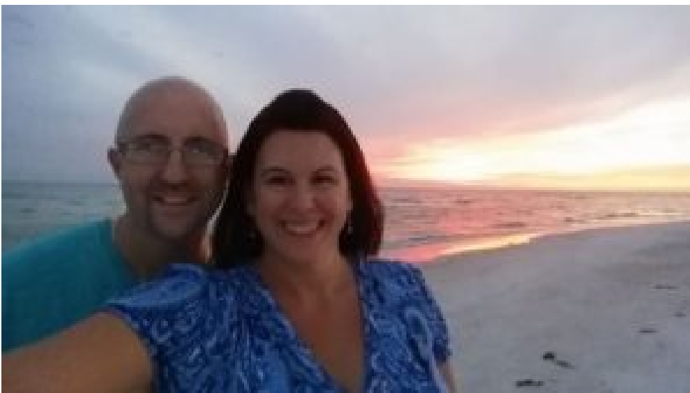
Sunset on Siesta Key Beach

If you'd like to know more about what we've done to transform our lives, get started with us today at http://EComMillions.com If it's for you, great – if not, that's ok, too. Either way – we want you to remember just what's possible in life and we wish you the very best!